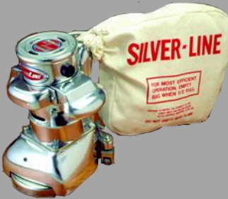
THE SL7 EDGER 7" 1.5HP 3600 RPM Disc Speed, two brushes, Heavy Duty Aluminum construction for long life in rental! (also available in 220v)