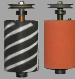
THE SL8 DRUMS The regular red rubber drum has been the industry standard since 1958. The Hook & Loop drum has been an alternative for the rental industry since 2005.