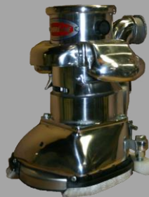
THE SL7D2 EDGER 7" 1.5HP 3600 RPM Disc Speed, two brushes, Dust deflector, glide bar and brush work together for excellent dust pick up!