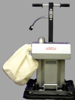
THE SL1218OVS 1.5hp motor runs the flywheel and vacuum system keeping dust from becoming airborne. Large flywheel allows for aggressive orbital action!