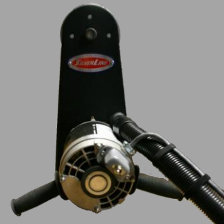
THE U2D .5hp motor runs 5" Hook & Loop or PSA paper. 10" nose gets into the hard to reach areas! Ready to be attached to a shop vac for dust containment. 12' Cord with inline switch, glide bar for smooth operation.