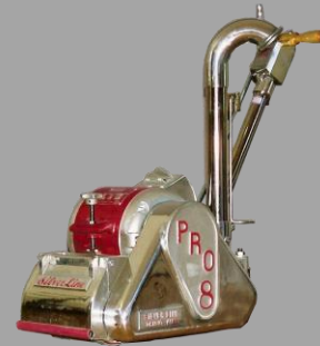
THE PRO8 5HP FLOOR SANDER 5Hp, 220 volt floor sander with 8" spring loaded drum. Motor mounts in the depressed chassis for great site lines. Motor dismounts easily for transportation!