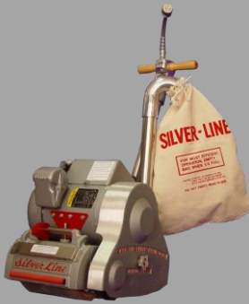
THE SILVER-LINE SL8 DRUM SANDER 8" Drum Sander with Dual Capacitor 1.5HP Baldor motor. Standard red rubber with cam action paper installation.