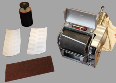
THE SILVER-LINE SL8V2 SANDER 8" Drum Sander with Dual Capacitor 1.5HP Baldor motor. Hook & Loop Drum for paper installation without any tools!